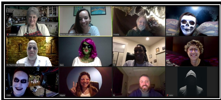
Virtual Haunted House: A Chose Your Own Adventure Experience