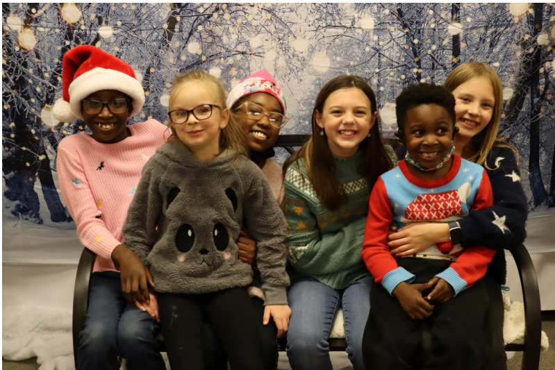
Our incredible volunteers “Team Kids” at the Winter Wonderland Event

Finally, our volunteers are the greatest because they are willing to give their time and talents to make sure our organization runs smoothly. This year we documented 865 hours of volunteer time by 35 people. We truly appreciate our volunteers for their commitment to The Arc Arapahoe, Douglas & Elbert Counties.